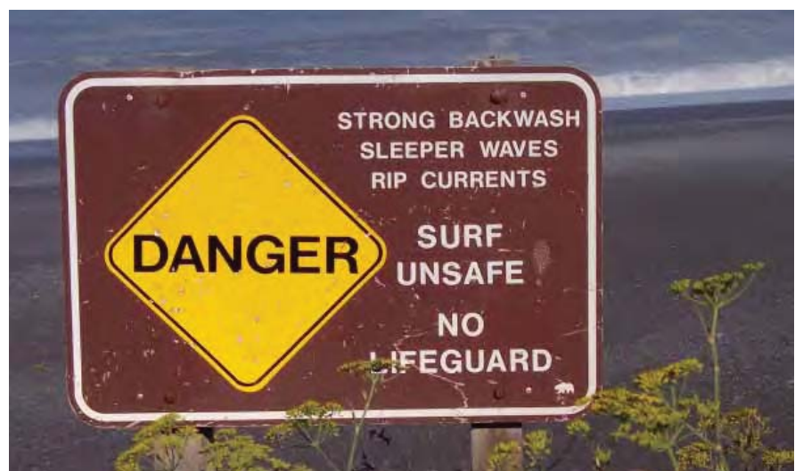
Figure 2—Strong surf is just one on a long list of hazards.

Lost Coast Wilderness dangers include high tides that leave miles of trail underwater, unexpectedly large “sneaker” waves, high winds, precarious cliffs, river crossings, slippery rocks, environmental hazards, and wildlife. Rescues often involve multiple agencies, including the Humboldt County Sheriff’s Office, Bureau of Land Management, Cal Fire, U.S. Coast Guard, local volunteer fire