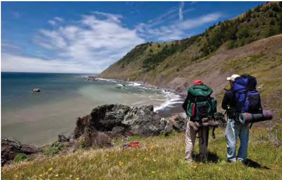
Figure 1—The tranquil scenery of the King Range Wilderness masks many dangers.

cues. Although these devices have sometimes alerted rescuers to emergencies early enough to save lives, it remains to be seen whether visitors, particularly those with limited wilderness experience and skills, may develop unrealistic expectations of rescue based on their possession of and reliance on these devices. Visitors may come to rely on these devices in the wilderness instead of developing appropriate knowledge, abilities, experience, and skills. The Royal Arches foursome is an example of an inexperienced group that used their beacon in place of appropriate knowledge, abilities, experience, and skills. When rescuers asked the men what they would have done had they not possessed the device, they said: “We would have never attempted this hike.” As a result of this type of incident, some rescuers refer to personal locator beacons as “Yuppie 911” (Cone 2009).