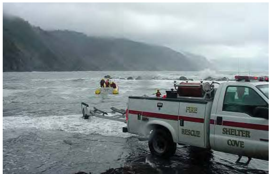
Figure 3—Ocean rescues are sometimes required along the King Range Wilderness coastline.

Visitors who enter the wilderness without adequate knowledge, skill, abilities, and equipment to return from their trip safely endanger themselves and rescuers. Respondents believed they should possess a greater level of wilderness skills and experience than they actually did. Many admitted to venturing into the wilderness with less preparation than they believed was necessary. Professional and volunteer rescuers and others are often left to fill in these gaps in skill and ability. This reliance on technology and rescue may